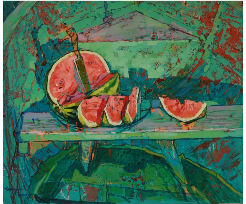
Watermelon in a Boat