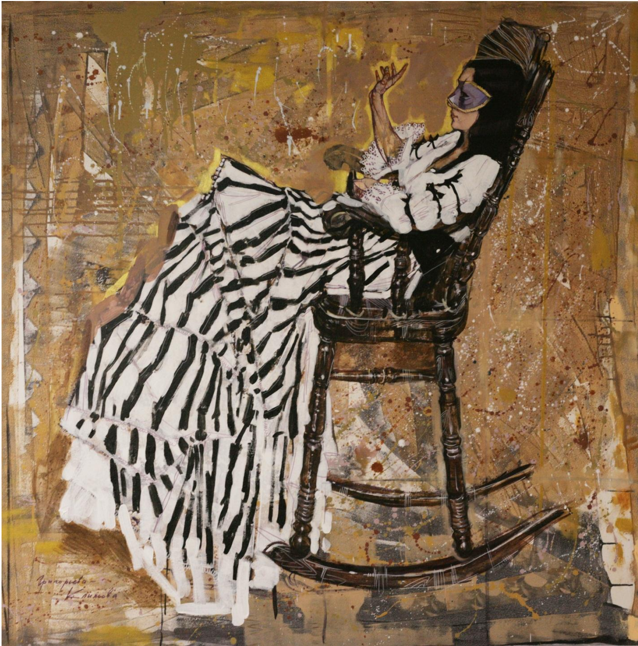
Colombiana acrylic on canvas 150x150, 2019