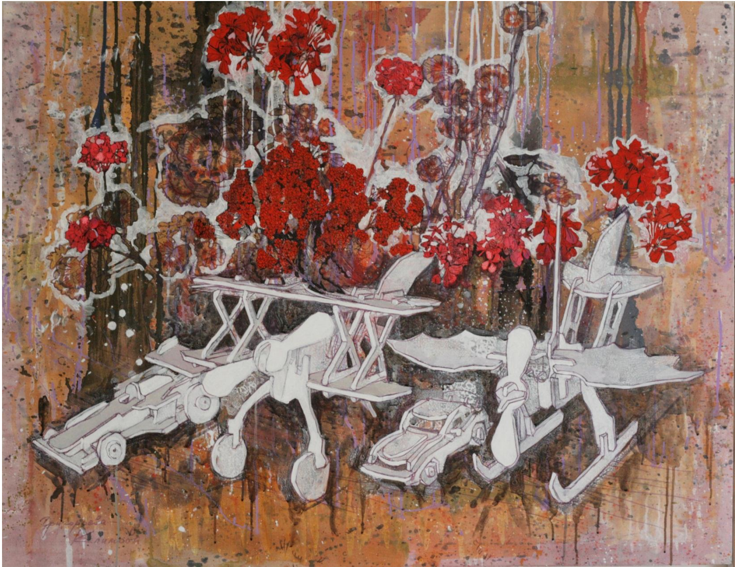
Still Life with Wooden Toys