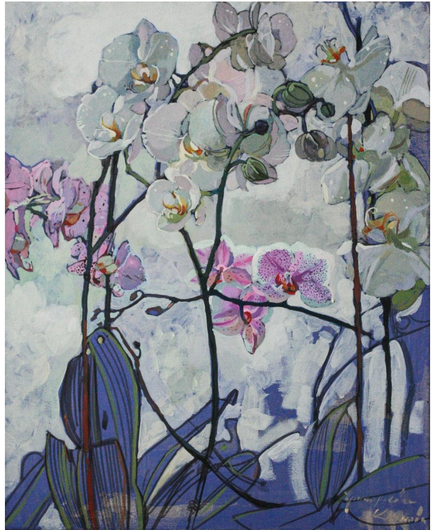
Orchids on Purple