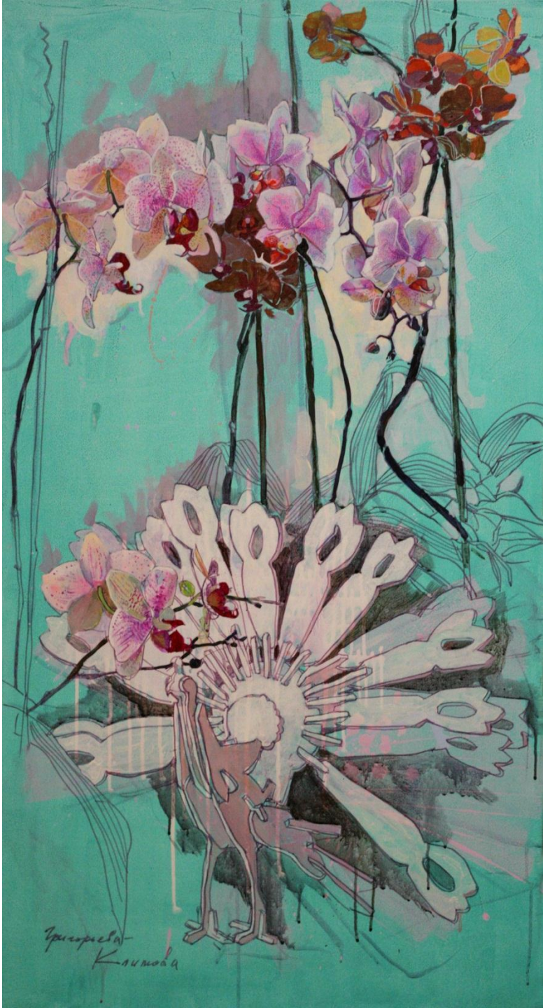
Peacock Still Life acrylic on canvas 145x75, 2019