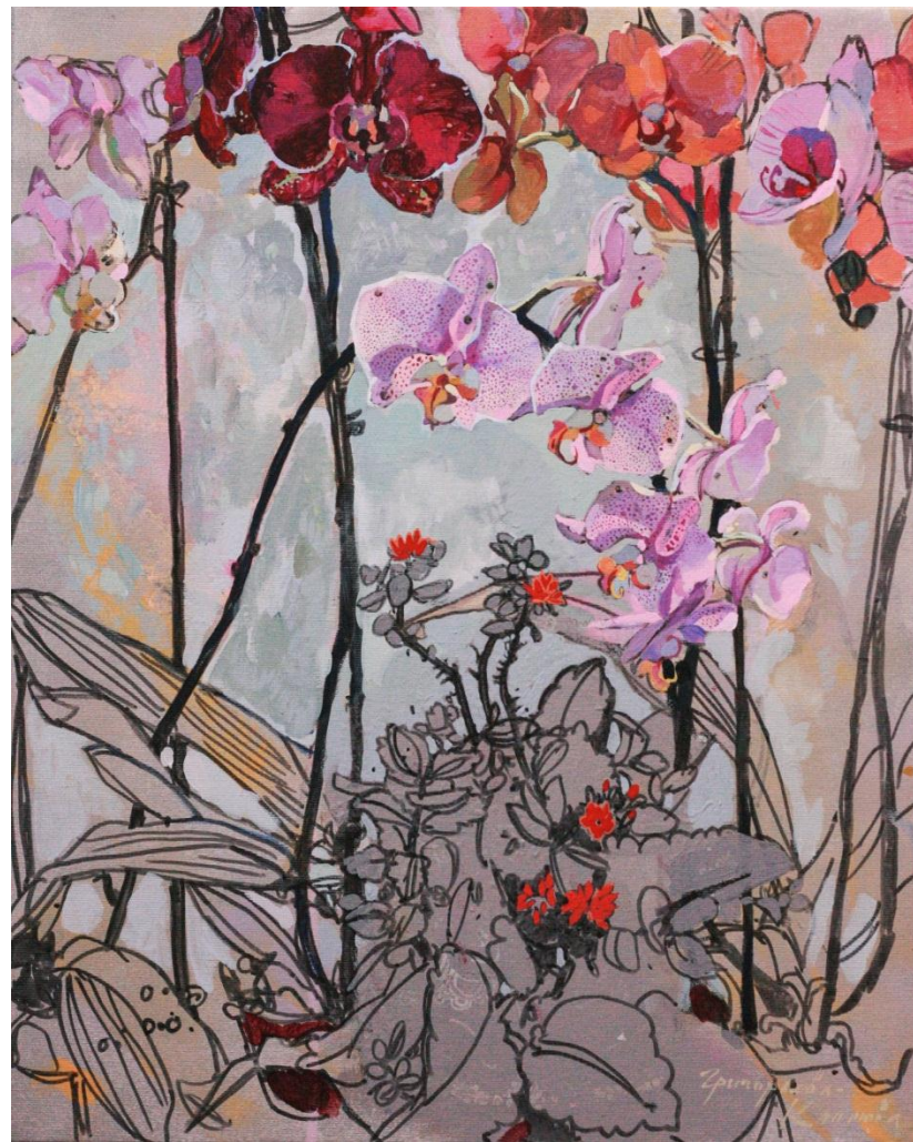
Orchids on Grey