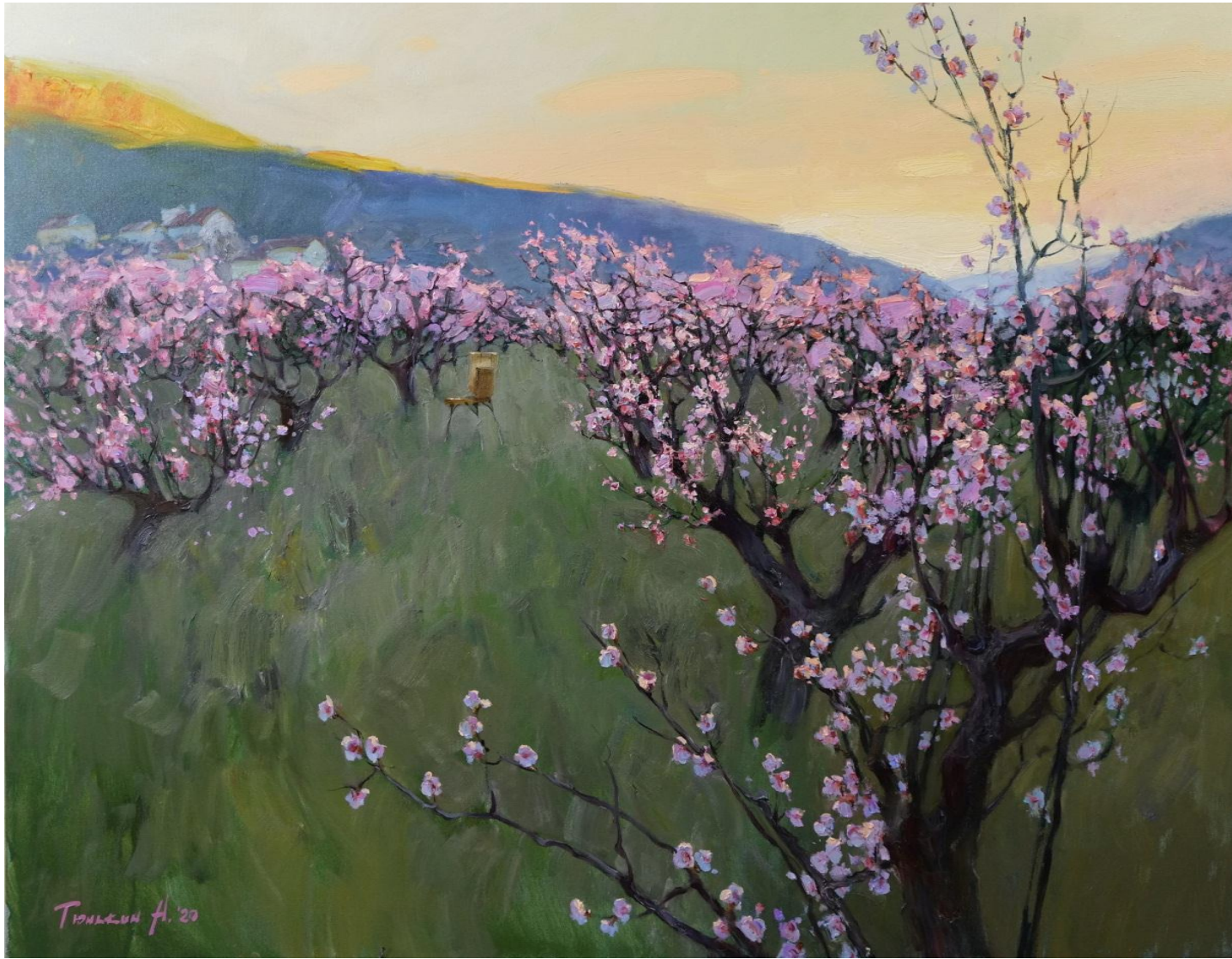
Evening in the Garden