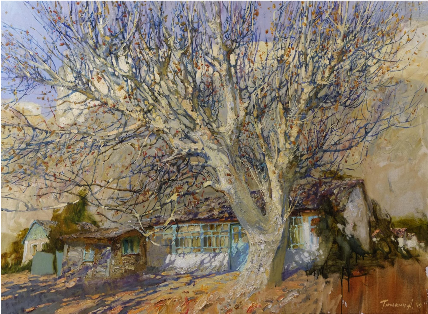
Under the Old Nut