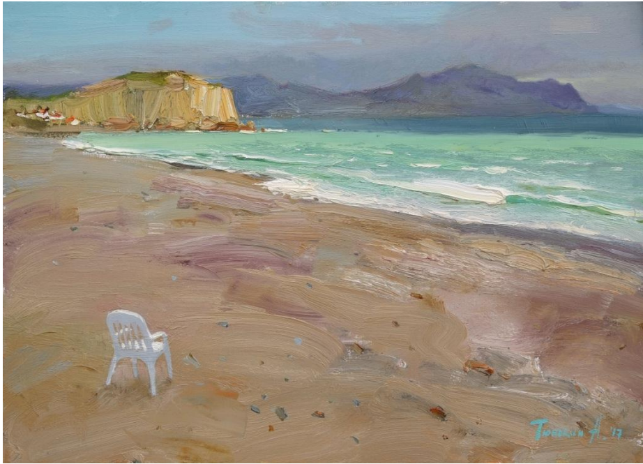
On the Beach