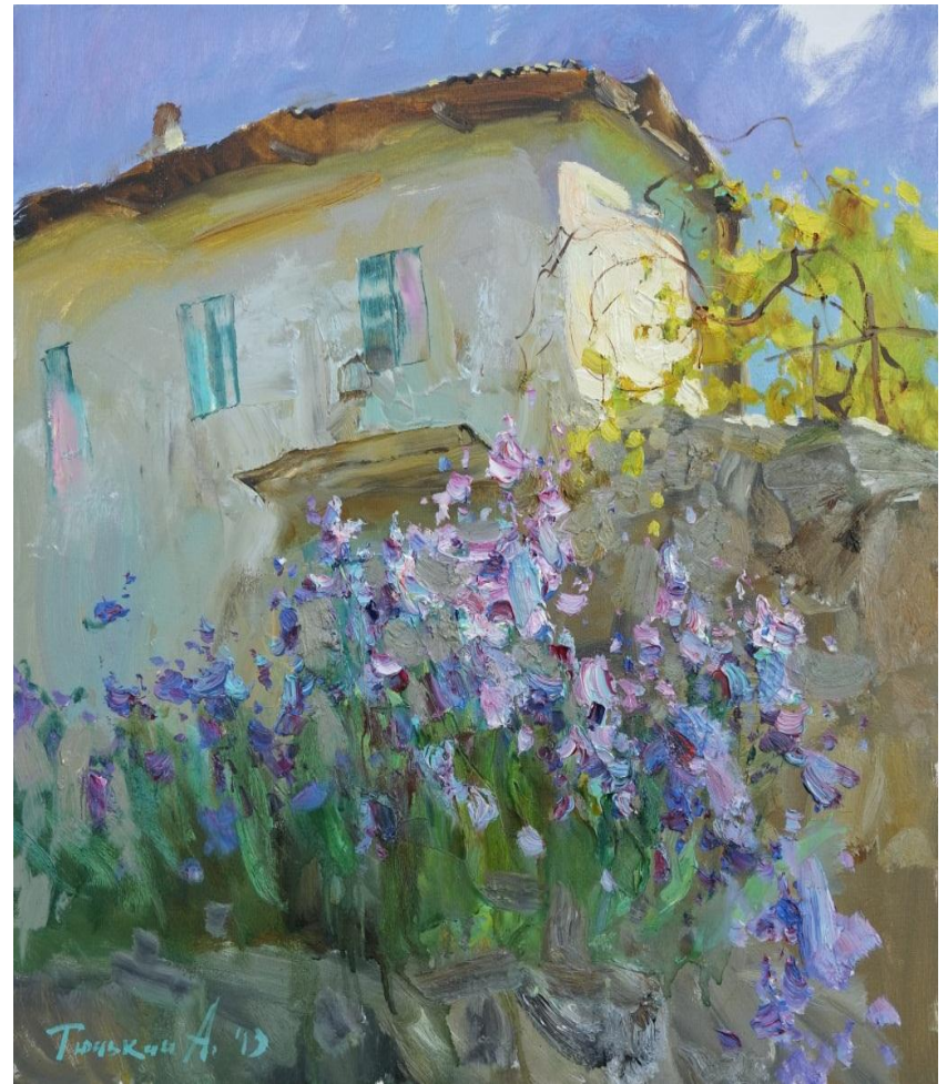
Irises oil on canvas, 70x60, 2019