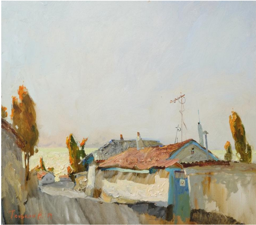
Road to the Sea