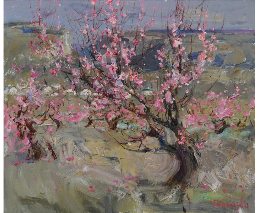
In the Peach Orchard