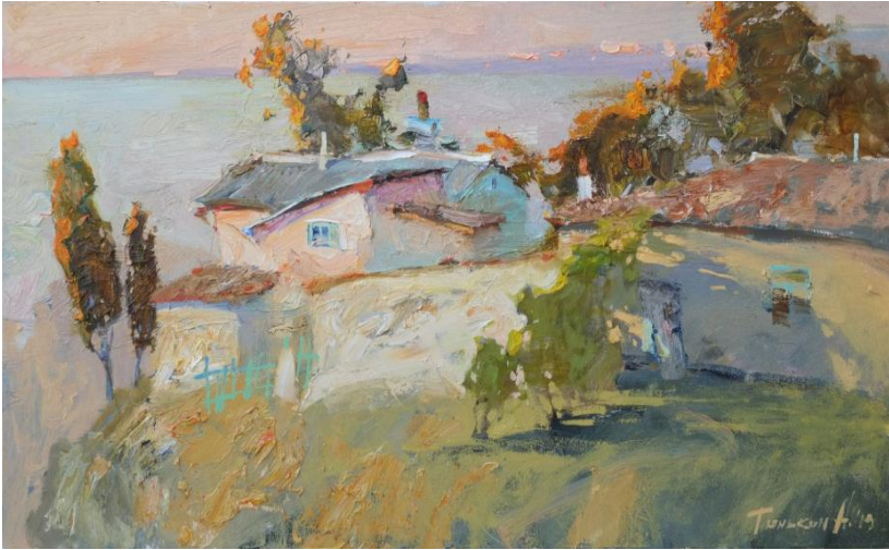
Life by the Sea