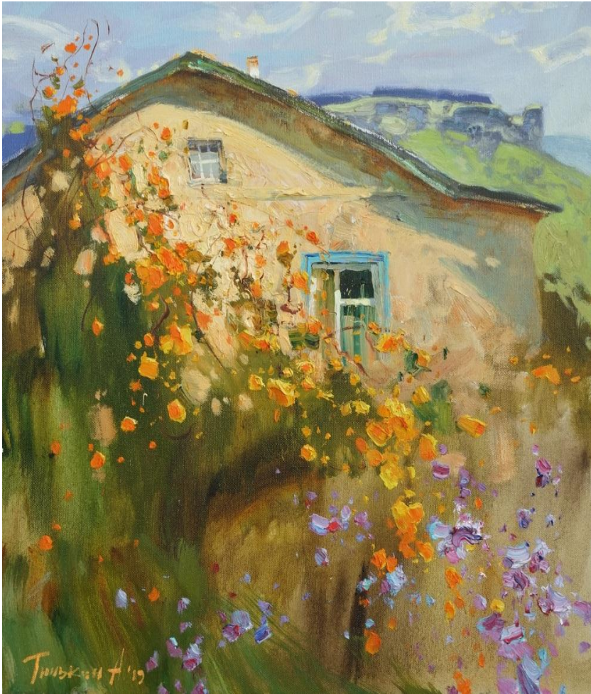
Among the Flowers oil on canvas, 70x60, 2019