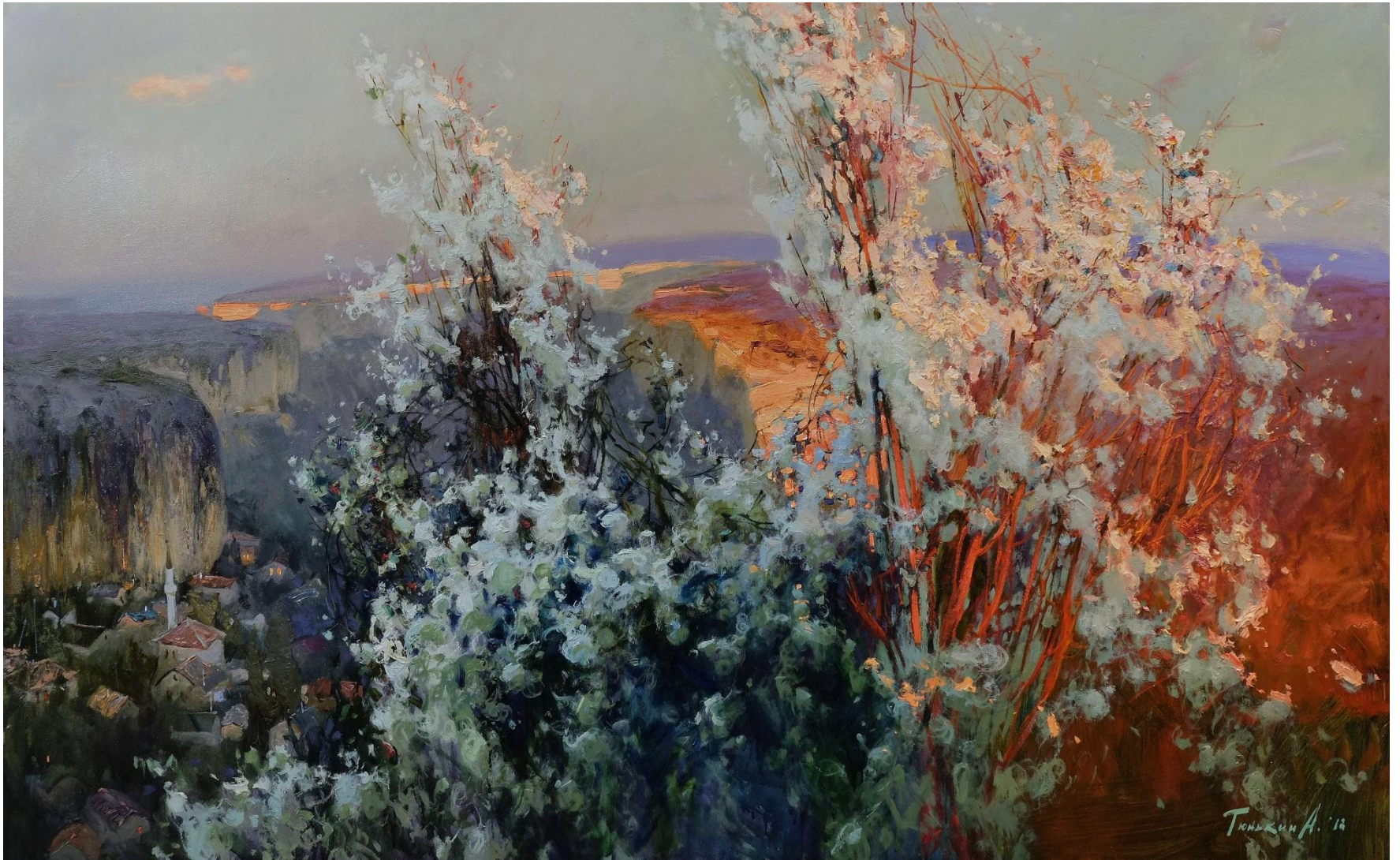
Spring Evening of the Old Town oil on canvas, 100x160, 2018