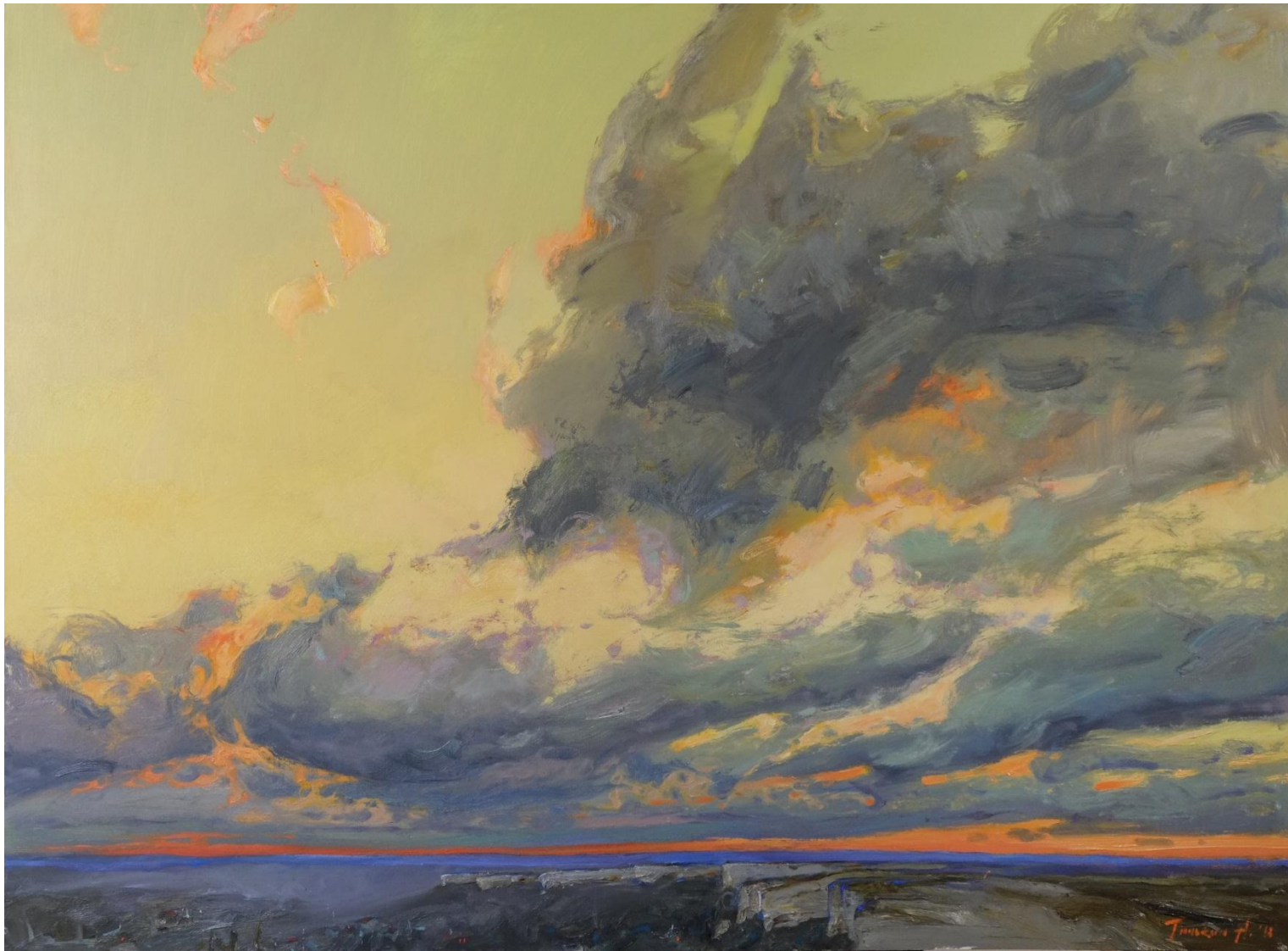
Under the High Sky