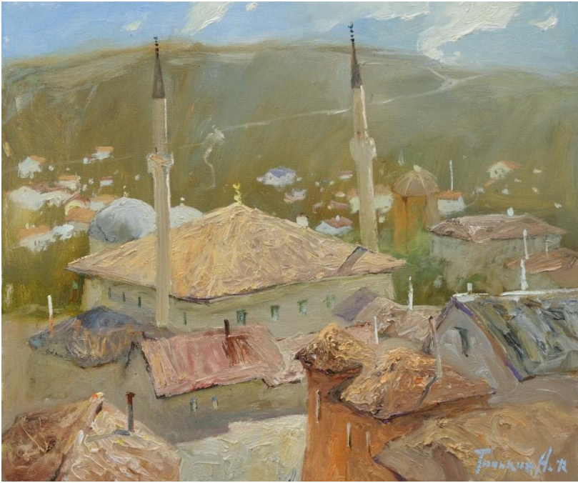
Noon in Bakhchisarai